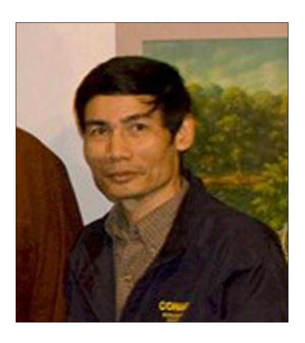
"Two cities - one feeling" - An Artist's Statement

I am a nostalgic person, and my favorite theme is the city streets of Hanoi - my home town. Hanoi, the capital city of the Socialist Republic of Vietnam is positioned in the delta of the Red River and is encircled by lakes, in fact the word Hanoi means "river interior."